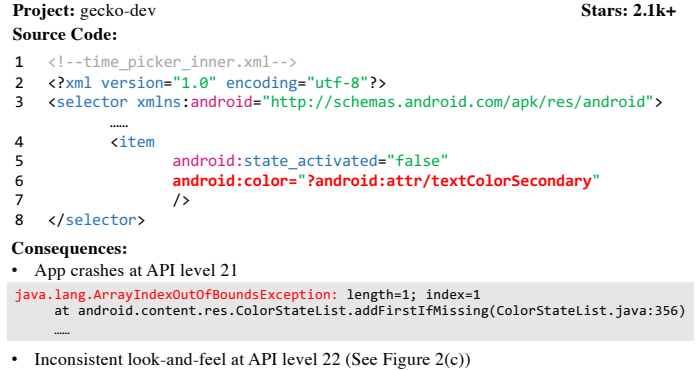
Fig. 1. A real-world example of configuration compatibility issues reported in BUG 1486200 of gecko-dev.

Android continuously evolves to meet different market demands, resulting in successive releases of thirty different API levels since its launch [1]. Each API level introduces functional changes to the Android configurations to cater for revised requirements. Such functional changes can cause the same configuration element in an Android app to manifest inconsistent behaviors at different API levels. We refer to such